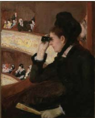
Mary Stevenson Cassatt, In the Loge (also known as Woman in Black At the Opera ), 1878, Oil on canvas, 81.28 x 66.04 cm (32 x 26 in.). The Museum of Fine Arts Boston, The Hayden Collection Charles Henry Hayden Fund, 1910.