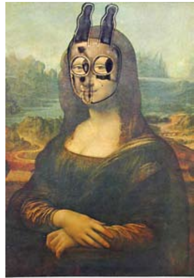
Ray Johnson, Untitled (Mona Lisa Bunny) , 1984, Collage on cardboard with reproduction of Mona Lisa , 18" by 12.5". Courtesy of The Estate of Ray Johnson at Richard L. Feigen & Co.