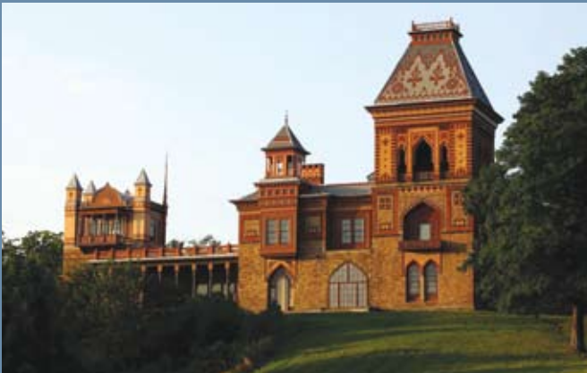
Olana created by Frederic Edwin Church (1826 -1900), a leading Hudson River School artist. The stone, brick, and polychrome stenciled Persian-style villa, shown above, is the best known element of Olana.

A charter bus will leave from The New York Historical Society at 170 Central Park West, New York at 10:00 AM. The day's activities include a picnic lunch on Olana's picturesque grounds, a house tour of Church's ornate, Persian-inspired villa, and a special exhibition preview. The new Evelyn & Maurice Sharp Gallery will feature a variety of F. E. Church's works representing Olana and environs. The bus will return to NYC at 6:00 P.M.