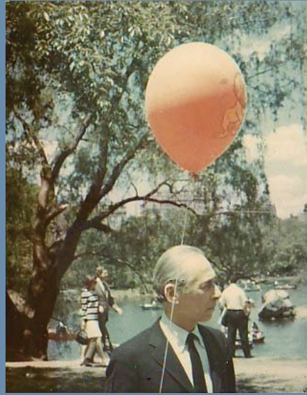
Portrait of Leo Castelli in Central Park, June 1967.