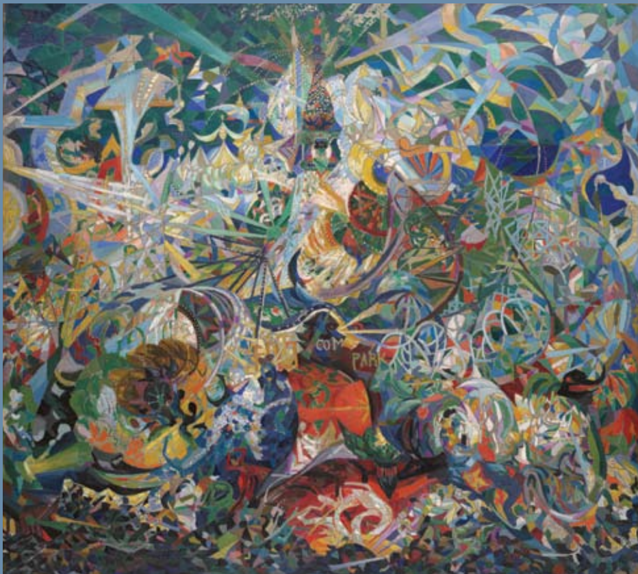
Joseph Stella, Battle of Lights, Coney Island, Mardi Gras , 1913–14, Oil on canvas, Dimensions: 195.6 x 215.3 cm (77 x 84 3/4 in.). Yale University Art Gallery, Gift of Collection Société Anonyme, 1941.689

This conference is dedicated to Harry L. Koenigsberg (1921–2002).