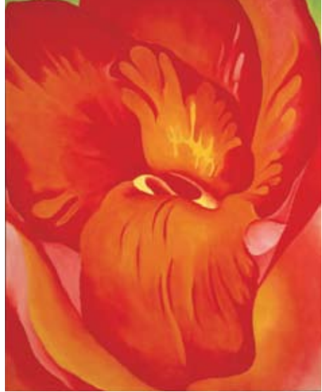
Georgia O'Keeffe, Canna Red and Orange , 1926, Oil on canvas, 20 x 16 in. (50.8 x 40.64 cm). Georgia O'Keeffe Museum, Gift of The Burnett Foundation (1997.06.39)