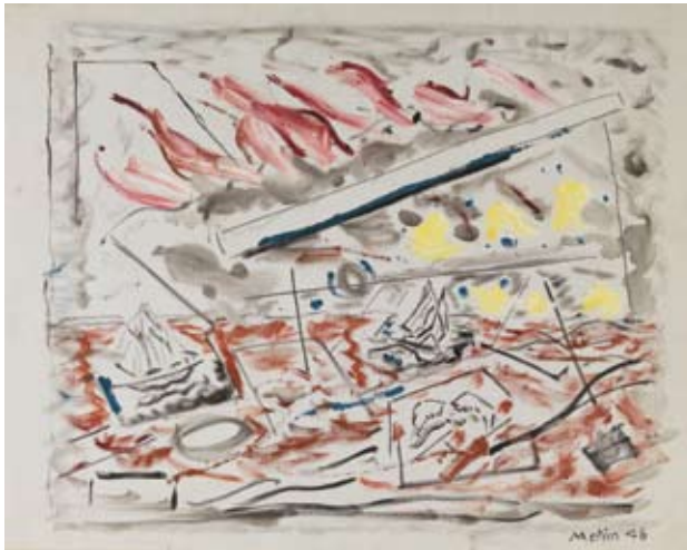
John Marin, Movement in Red, 1946, Oil on canvas, 25 x 32 inches